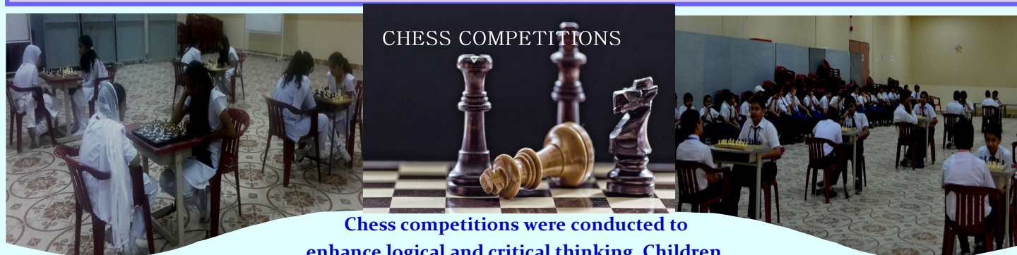
Chess competitions were conducted to enhance logical and critical thinking. Children participated with great zeal and enthusiasm..